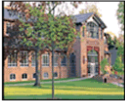
Paul J. Gutman Library