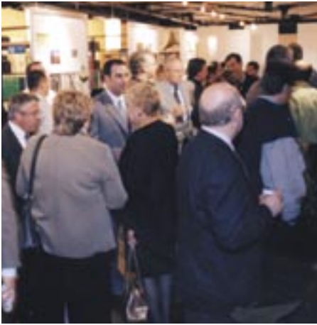
A well-attended reception in October 2002 marked the opening of The Engineering and Design Studio.