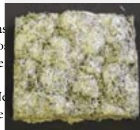
Foam with shredded money reinforcement. The Federal Reserve typically burns used money. In this case the money is shredded and reused as fiber reinforcement.

energy city in the affected housing oment of an energy-saving l with substantial reused or sus- agricultural content; g opportunities through union personnel and apprenticeship programs, thus potentially expanding local employment; • Product commercializa- tion, market transformation and local economic develop- ment opportunities; and