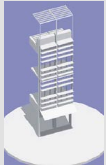
Horizontal and vertical shading devices protect interior spaces from hot, summer sun, thereby greatly reducing cooling loads for the building.