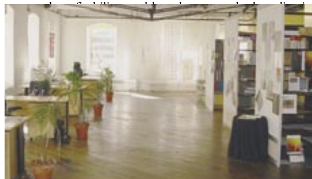
The Space: lessons in sustainable interiors.

The Studio has received federal funding from the National Textile Center (NTC) to study the role of sustainable carpeting in increasing carpet-industry competitive-