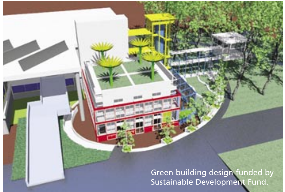
Green building design funded by Sustainable Development Fund.