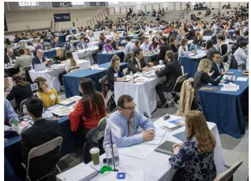
Design Expo 2018

The HireJefferson job board received 1,488 job postings (89% of which are internships or entry-level jobs), by 592 unique employers.