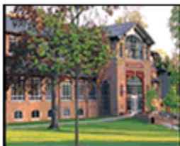
Paul J. Gutman Library