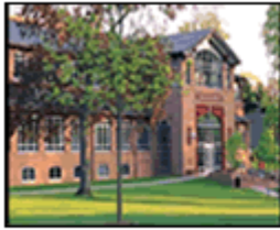
Paul J. Gutman Library