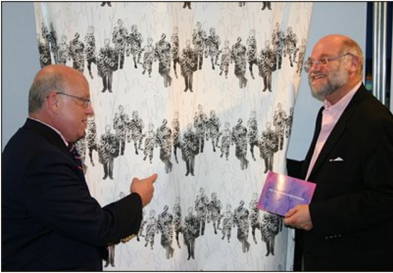
DesignPhiladelphia Kicks Off