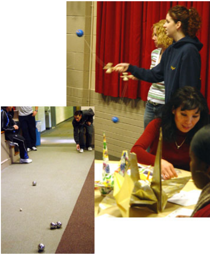
Pictured above: Students and other members of the University community enjoyed some friendly international competition playing the French lawn game Petanque (left) and tested their hand eye coordination with Japanese activities Kendama (right-background) and the paper-folding art of Origami (front-foreground).