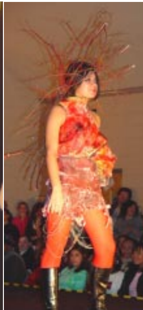
Designed by Krystal Hoffacker '04