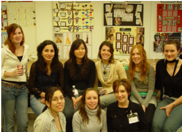
Pictured above are a few of the Fashion Design students who presented their work at the exhibition.

On Feb. 22, Fashion Design students and faculty presented an exhibition of designs inspired by their study abroad trips to Rome and London. The University community was invited to enjoy the projects, photos and stories from the trip and tasty Italian and English treats.