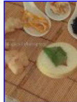
see detail in secondary window