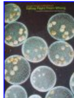
see detail in secondary window