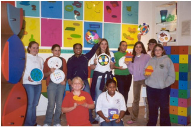
Members of Roxborough's Troop 129 enthusiastically display the pieces they created while visiting The Design Center at Philadelphia University and its latest exhibition, Playing the Field: the art + design of Godley-Schwan .