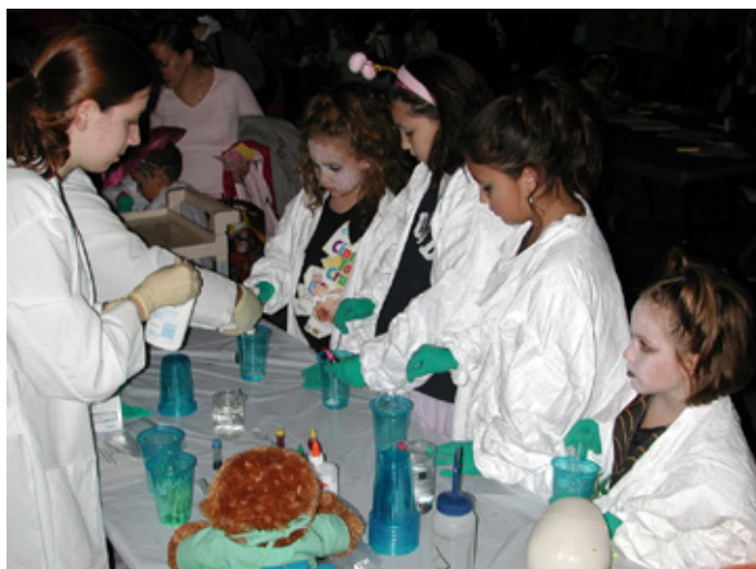
The SIA/Pre-med Society was voted number one activity booth by the children and attendees for their "Mad Scientist Lab."

Falls, Roxborough and Manayunk came in costume to enjoy the free activities.